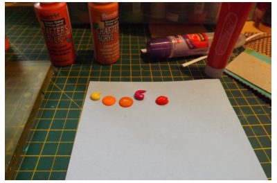
1. Dot paint onto Fun Foam sheet the width of your brayer.