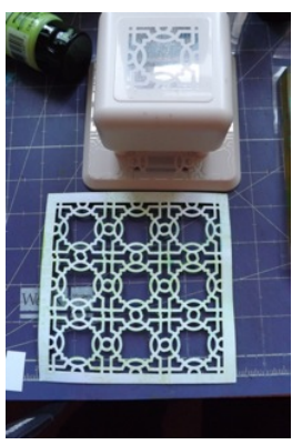
1. Punch stencil, cut to size, leaving a frame

Notes: light over dark or dark over light