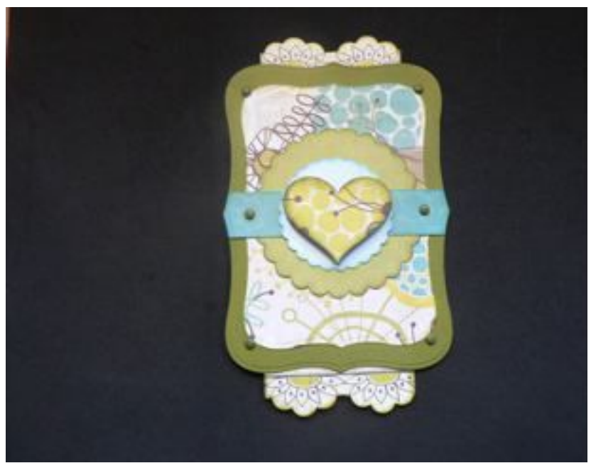
I haven't yet, but would add PULL to the tab that activates the mechanism.

To make the mechanism work you will now stick the two tags, one with the BACK of the tag to the FRONT of the plastic and one with the FRONT of the tag to the BACK of the plastic