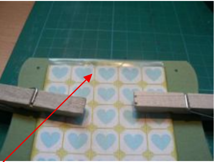
Flip it over and repeat the placement and trimming of the second tag.

Now stick the tags to the bag. For full extension, the straight edge of the tag should just about match the edge of the label but experiment with placement and see how it changes how far the tags extend