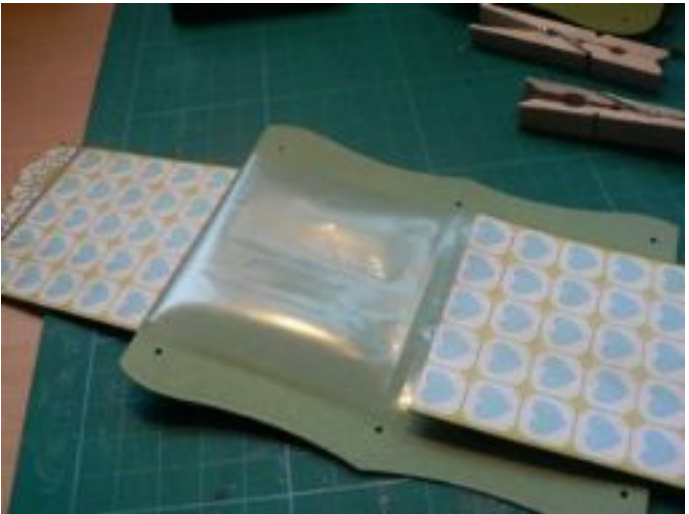
Now you should be starting to see how it works! When you pull one tab, the bag will rotate around the label and as you pull one tab, and the bag rotates, the other label will move out. Pretty nifty, hum?